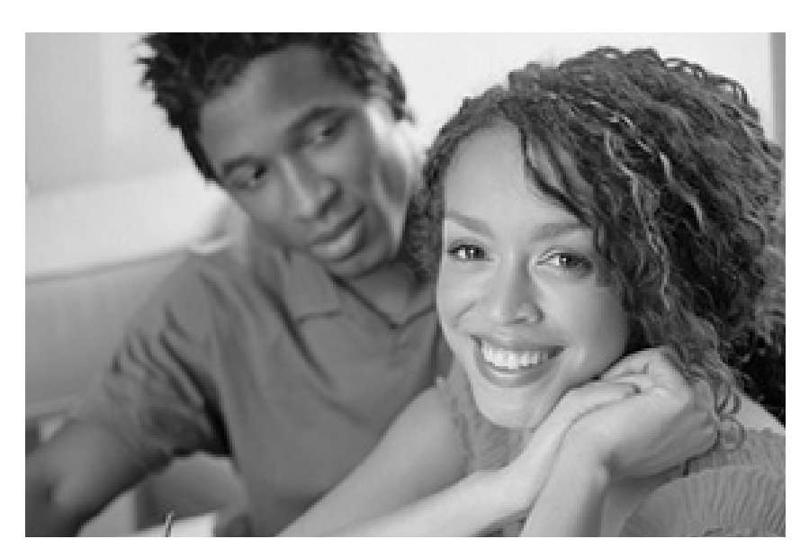
continuum of human sexual development" for parents, teachers, clergy and others.

Satcher also stated that more research must be done on abstinence-only programs before a conclusion can be reached on its effectiveness. The report found "no scientific support" showing that sex education classes causes teens to engage in sexual activity. In fact, the report shows that students who are taught comprehensive sex education are more likely to use contraception once they are sexually active. The first step, he states in the report, must be a dialogue between parents and teens. But he also says the schools "play an important role," referring to them as "great equalizers" in healthy sex education.